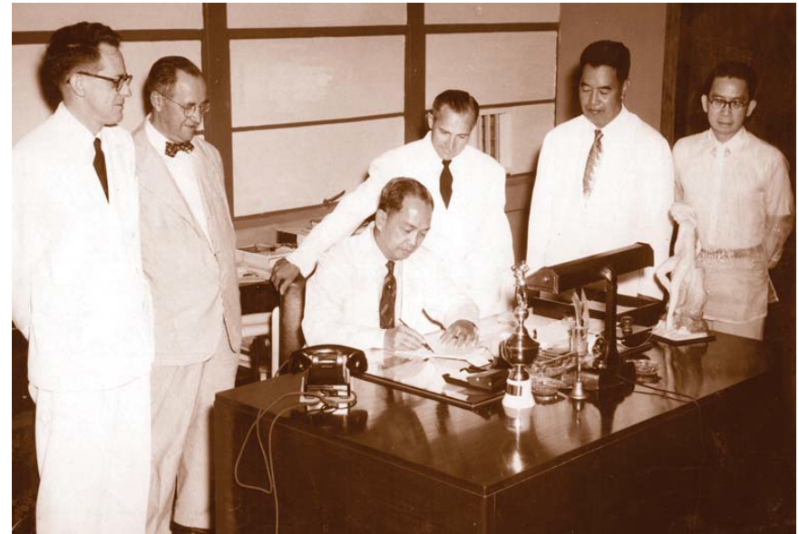
MOA signing between the officials of the University of the Philippines and the University of Michigan to establish the Institute of Public Administration (1952).