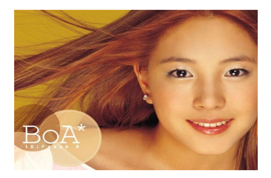
Figure 1. BoA's Id; Peace B album cover (SM Entertainment, 2000)

It was also stated in the feature that after two years of rigorous training, Lee Soo Man finally decided that BoA is ready to take on the Korean music industry which was then dominated by pop groups such as S.E.S. and H.O.T. The rookie climbed her way to national stardom when she released her debut song, "ID; Peace B" and the public could not get enough of her fresh vocals and amazing dance moves. By the end of the year 2000, the singer was able to bag awards from various music stations in South Korea.