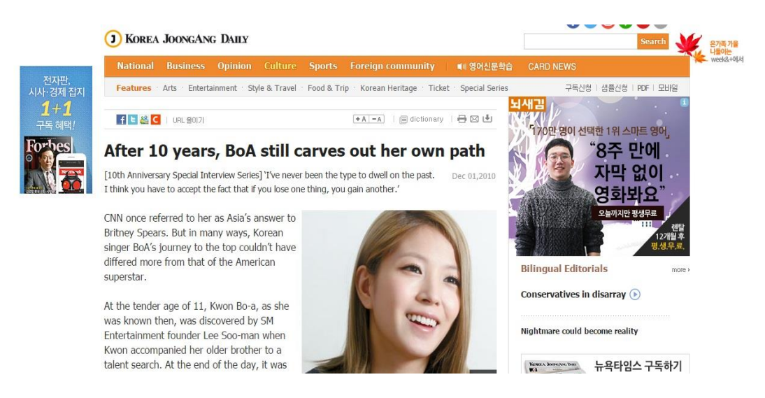
Figure 7 . After 10 years, BoA still carves out her own path article screenshot (Joongang Daily, 2010)

Joongang Daily's article is similar to allkpop's feature in several ways. Both showed a timeline of her releases since her debut. This particular article also gave an estimate on her album sales and it reiterated how her 2005 South Korean album, " Girls On Top " marked her way to numerous major music awards by the end of that year although it relatively sold less than her previous materials. At that time, she started singing songs with lyrics that told the listeners about different issues such as male chauvinism. The feature also discussed how she and SM Entertainment really wanted to take over the American market and up to what extent did the pop icon adjusted her music in order to get the attention of the American pop music lovers.